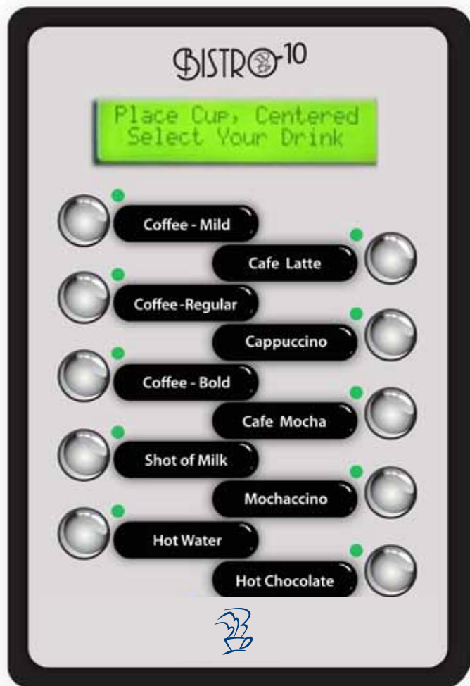
Close-up of membrane switch showing our standard drink options

Bistro 10 entire front can be custom branded with your image helping you to promote your brand and services.